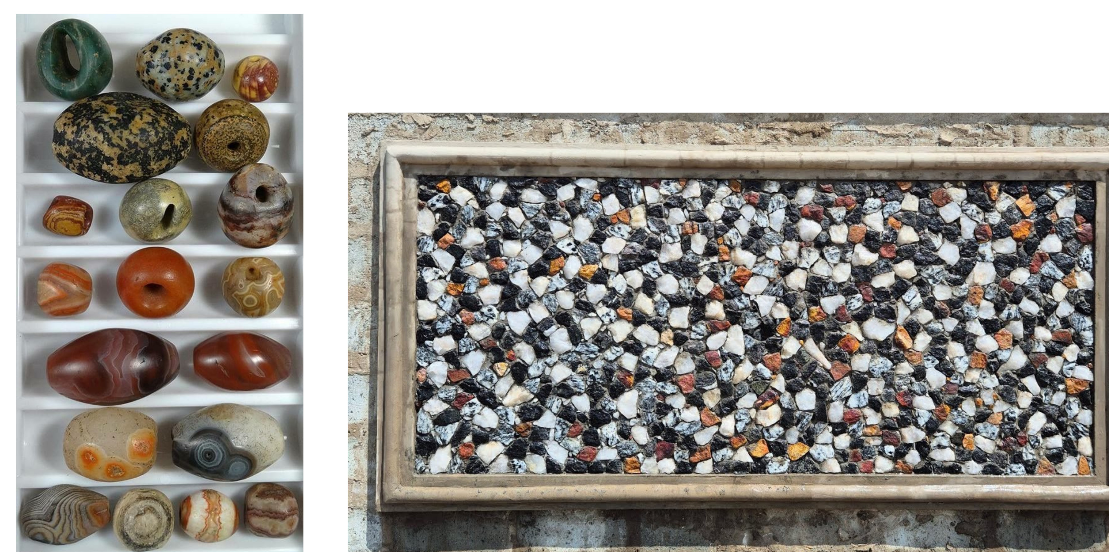
Beads and other glass artifacts can be observed inside the Van Cortlandt house; these remnants were the source of inspiration to elevate the brief moments of joy and beauty in the life of a laborer.