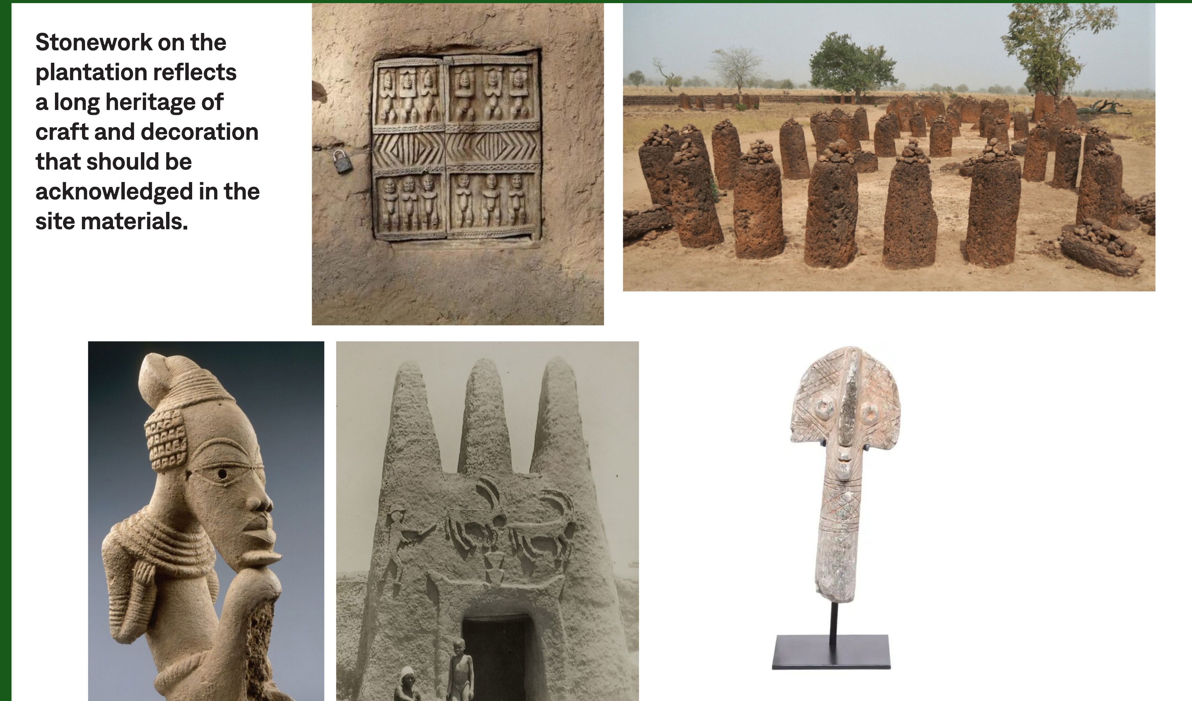
Stonework on the plantation reflects a long heritage of craft and decoration that should be acknowledged in the site materials.