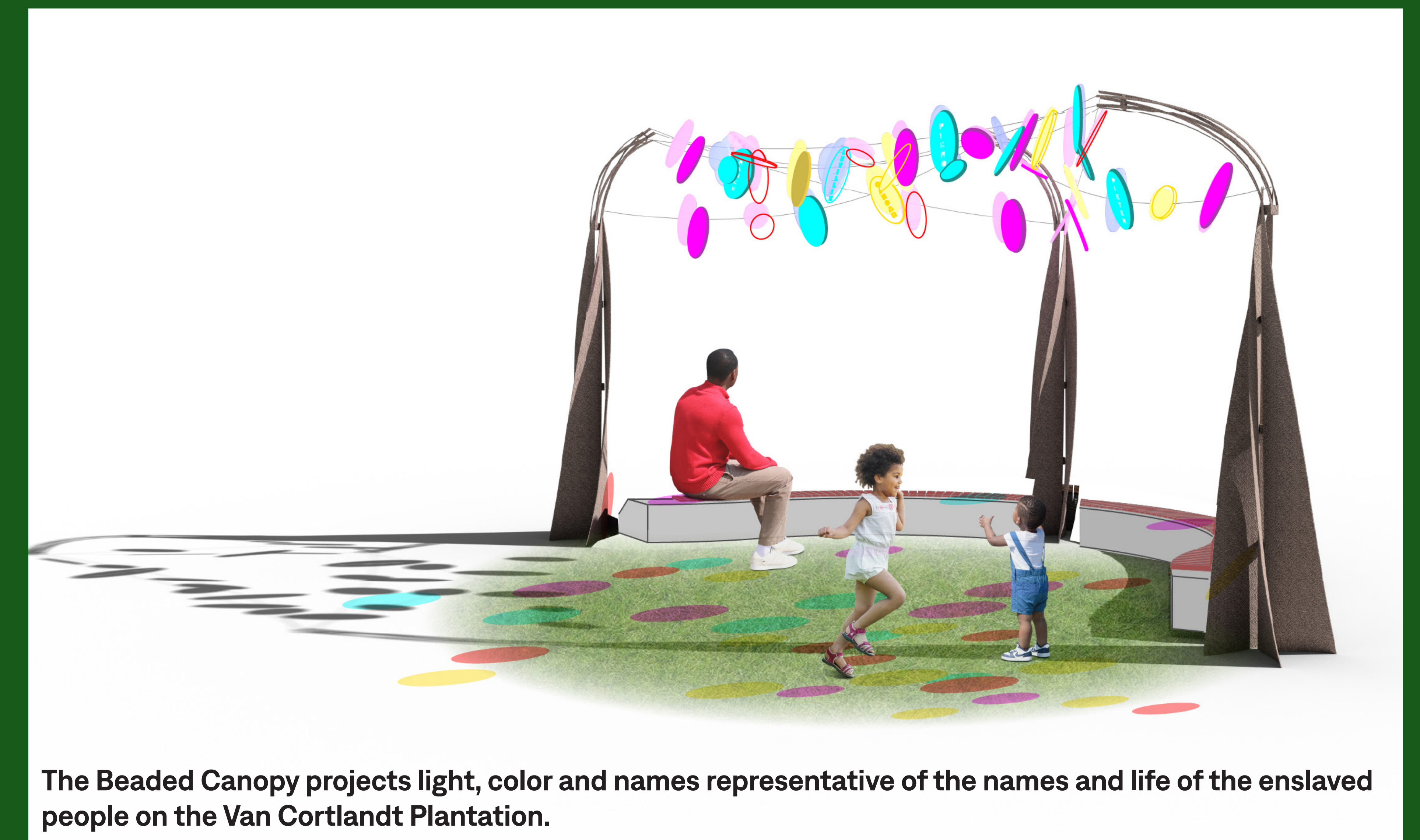
The Beaded Canopy projects light, color and names representative of the names and life of the enslaved people on the Van Cortlandt Plantation.