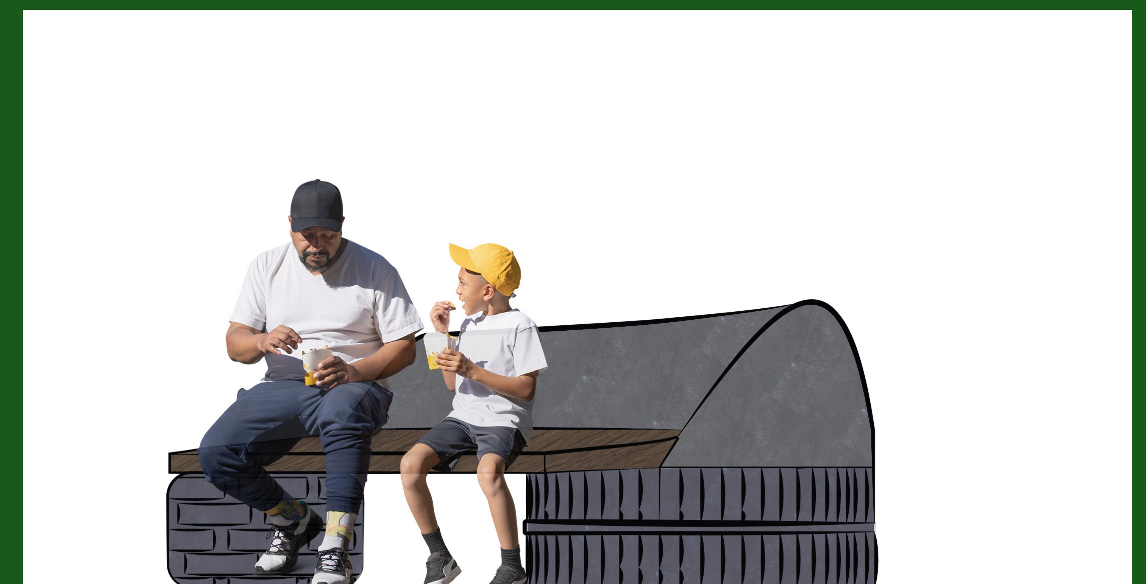
The stone bench represents both the labor and the craft of the enslaved people who built the Van Cortlandt Plantation and other sites throughout New York City.