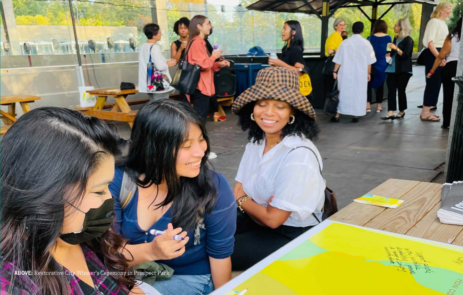
ABOVE: Restorative City Winner's Ceremony in Prospect Park