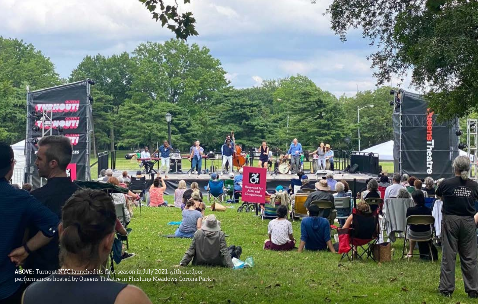
ABOVE: Turnout NYC launched its first season in July 2021 with outdoor performances hosted by Queens Theatre in Flushing Meadows Corona Park.