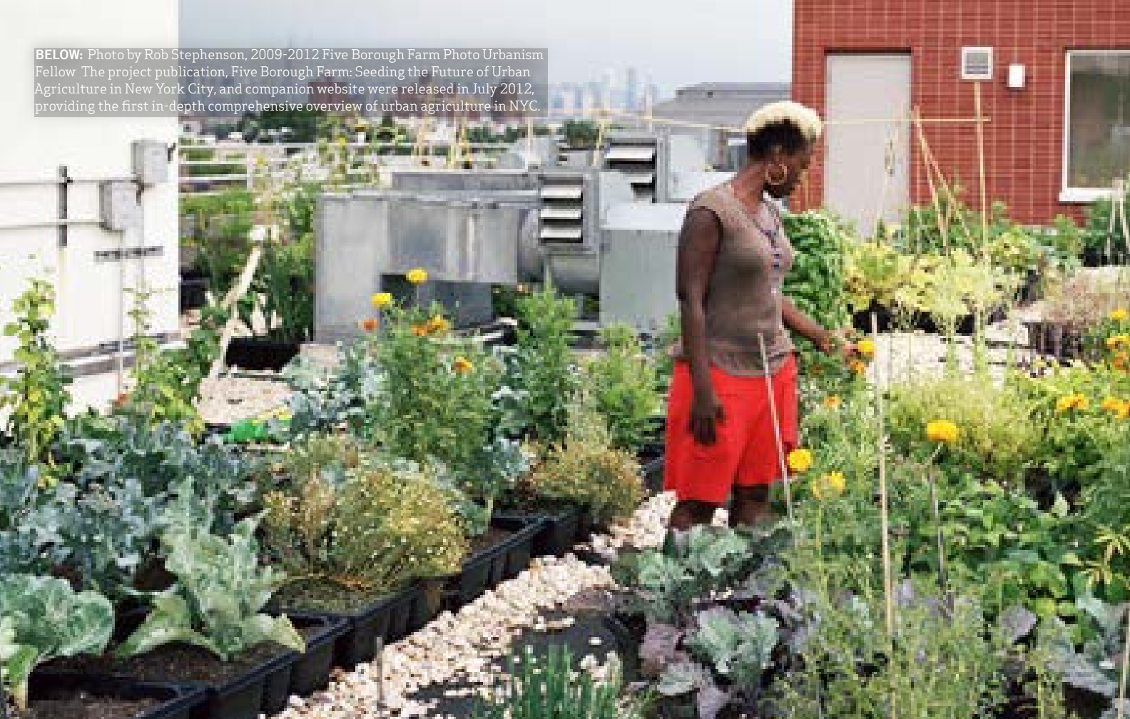
BELOW: The project publication, Five Borough Farm: Seeding the Future of Urban Agriculture in New York City, and companion website were released in July 2012, providing the first in-depth comprehensive overview of urban agriculture in NYC.