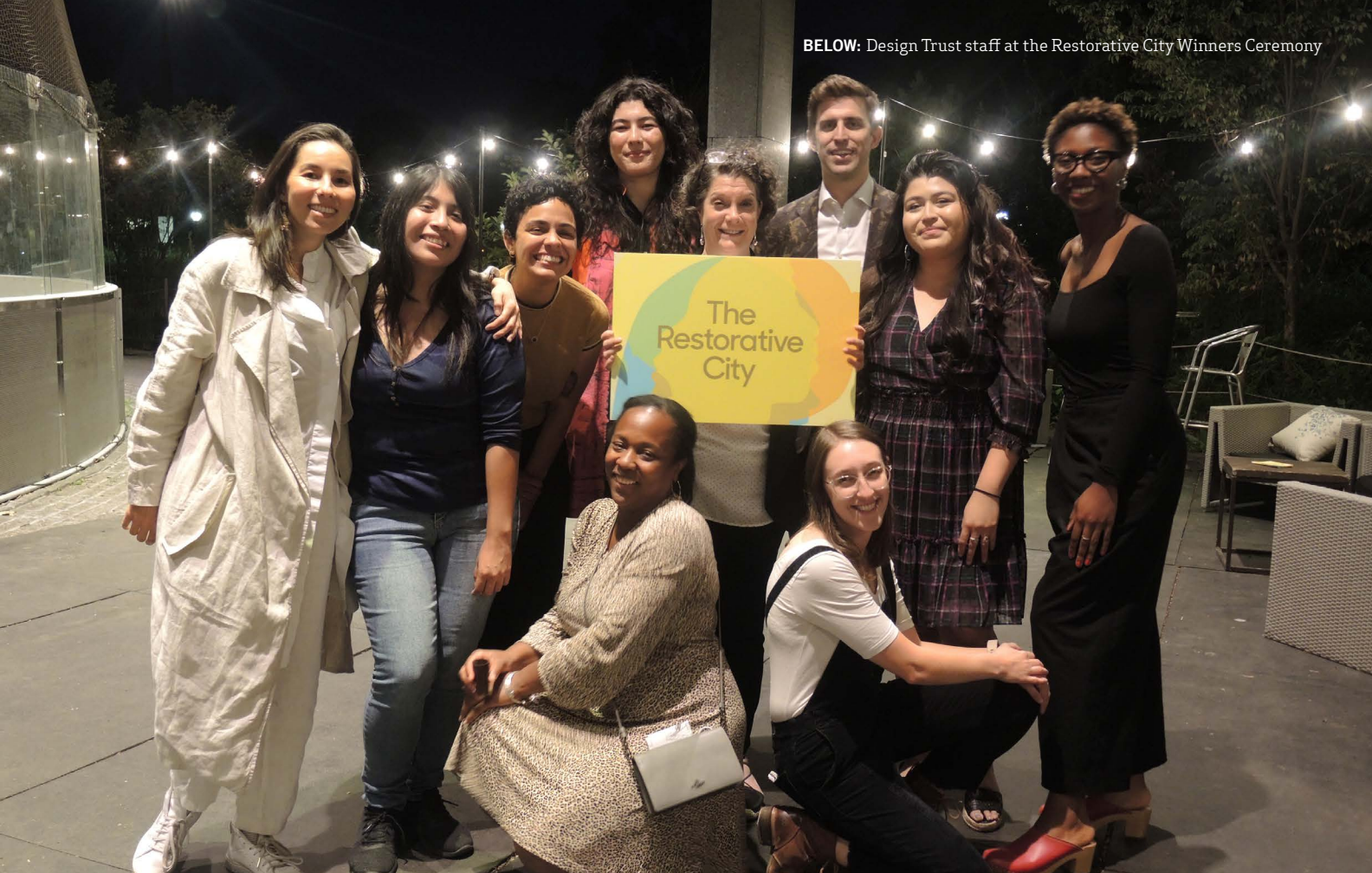
BELOW: Design Trust staff at the Restorative City Winners Ceremony