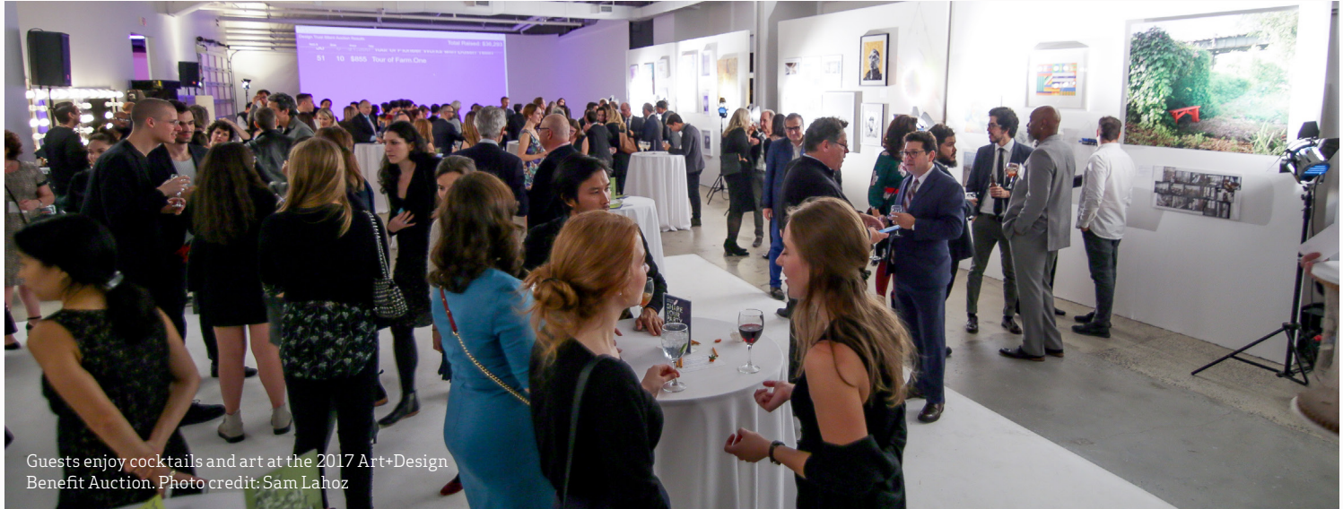
Guests enjoy cocktails and art at the 2017 Art+Design Benefit Auction.