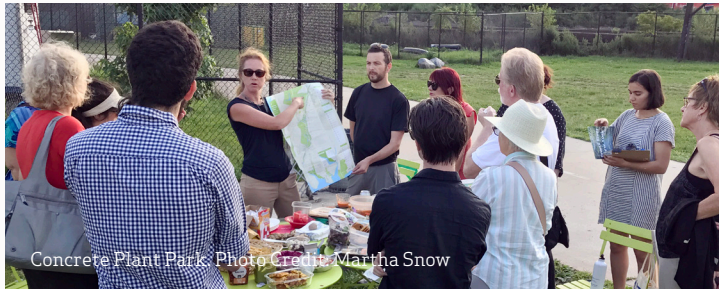
Concrete Plant Park.