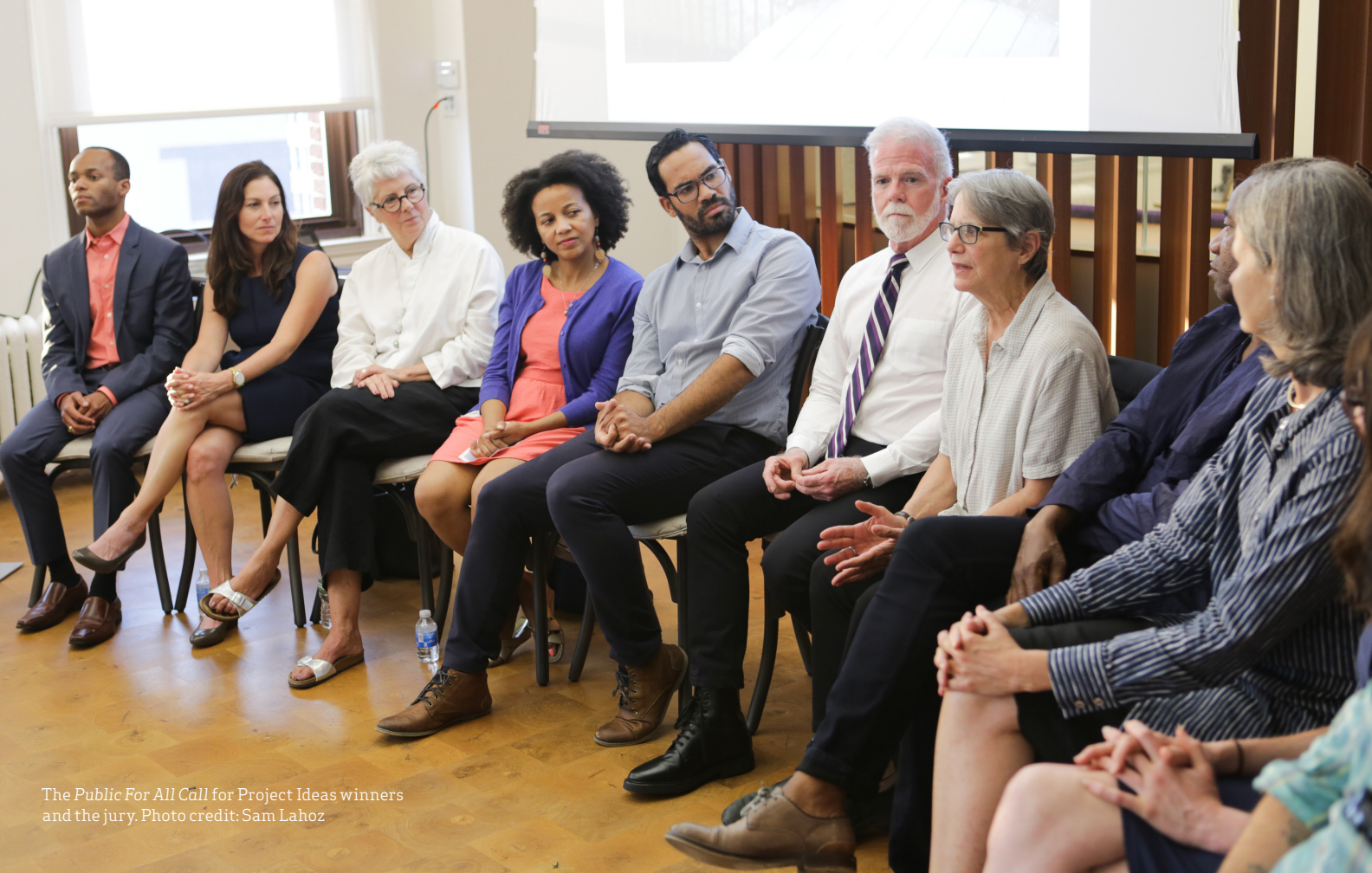
The Public For All Call for Project Ideas winners and the jury.