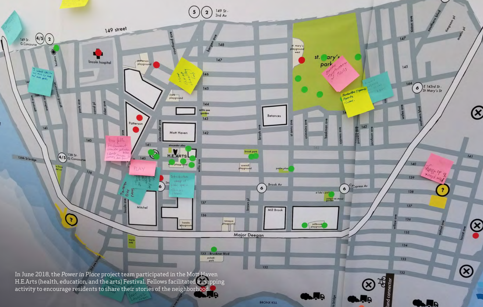
In June 2018, the Power in Place project team participated in the Mott Haven H.E.Arts (health, education, and the arts) Festival. Fellows facilitated a mapping activity to encourage residents to share their stories of the neighborhood.