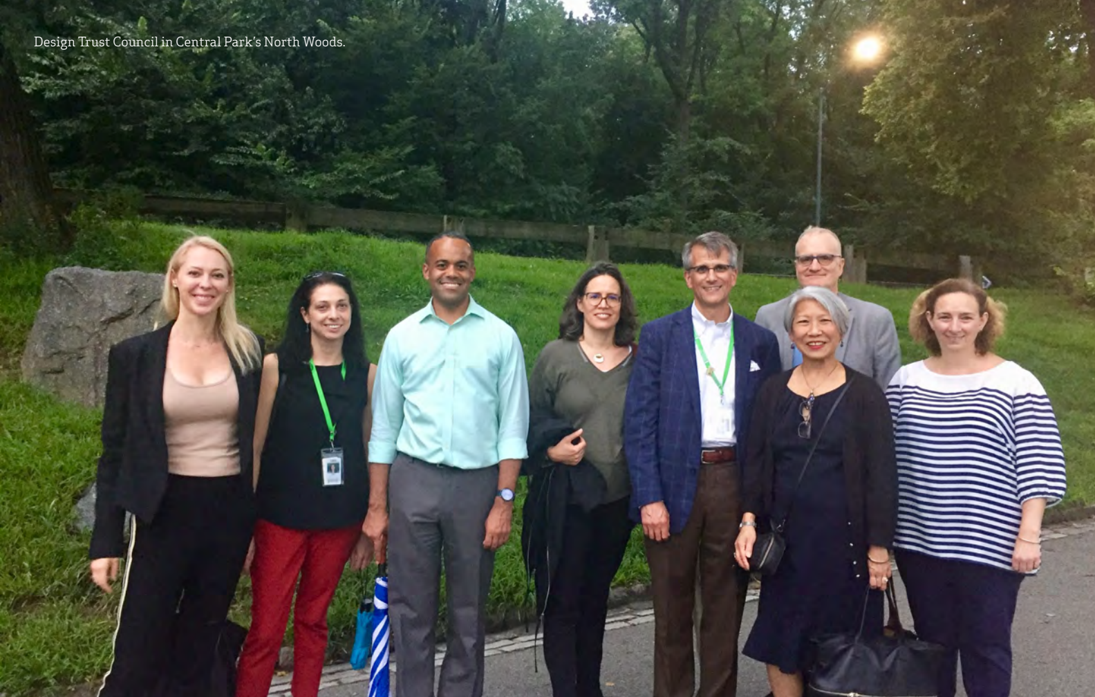
Design Trust Council in Central Park's North Woods.