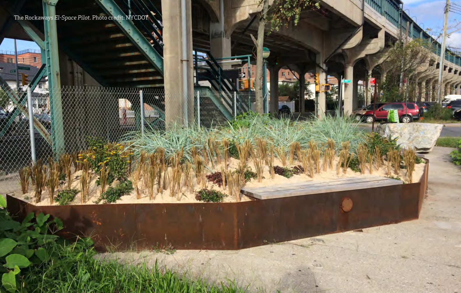
The Rockaways El-Space Pilot.