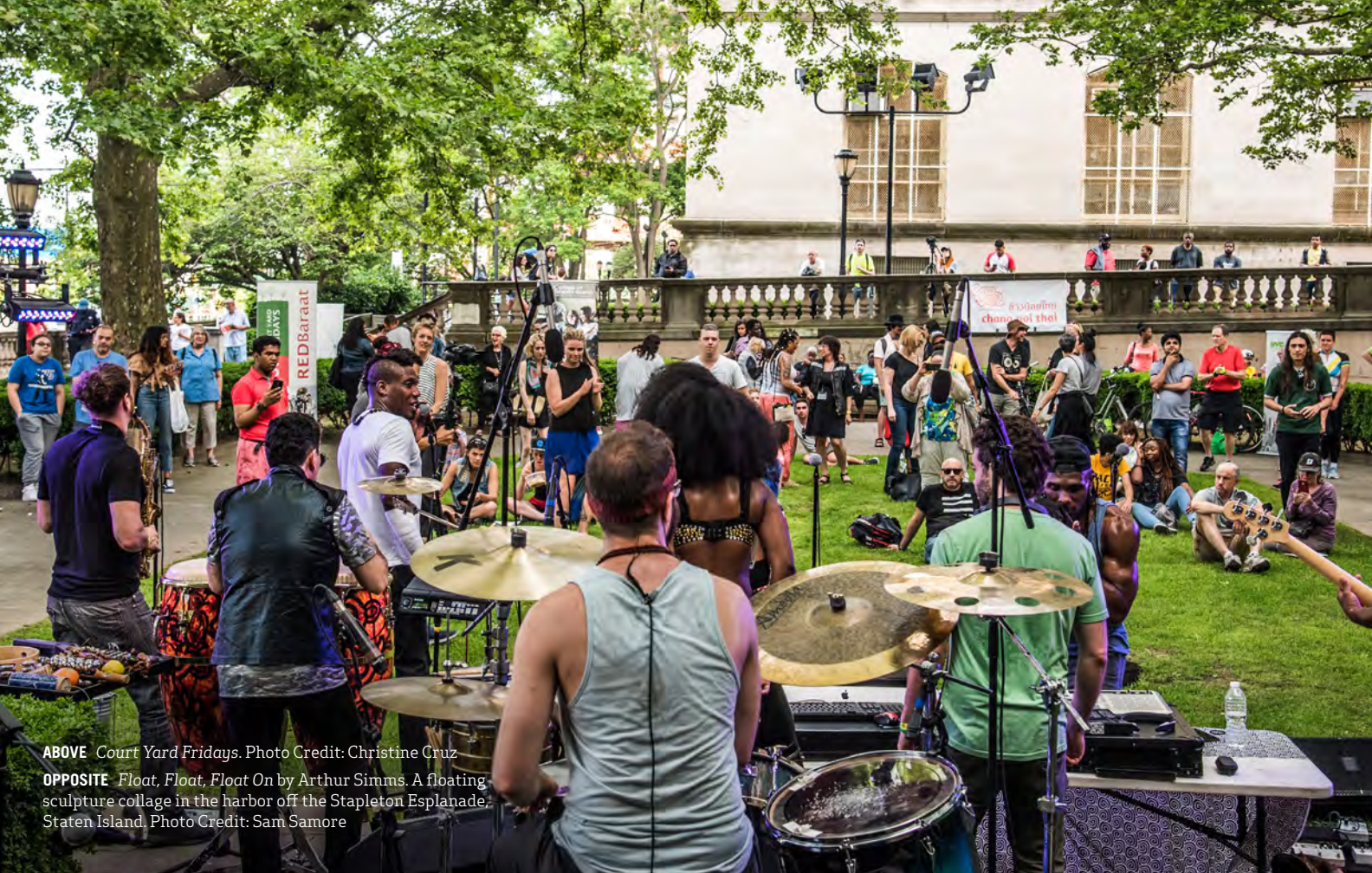
ABOVE Court Yard Fridays.