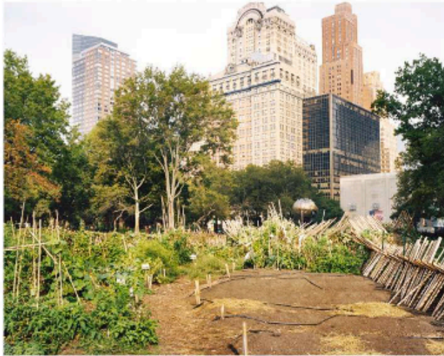
ABOVE The Battery Urban Farm, in Manhattan.