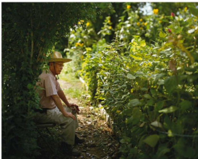
ABOVE In the shade of Kissena Corridor Community Garden, in Queens.