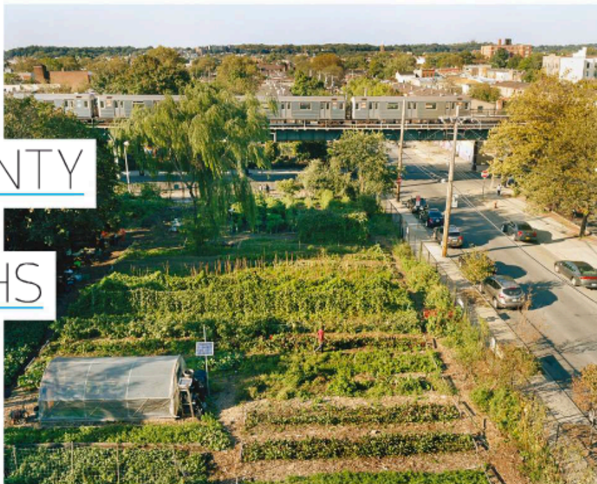
ABOVE East New York Farms, in Brooklyn.

T he Leave It Better Kids' Community Garden, in the Morris Heights section of the Bronx, occupies a corner lot just a few blocks from an elevated part of the subway line that runs along Jerome Avenue. A pawn shop and a run-down deli are on either side, and the Gospel Tabernacle Church is around the corner. It's a calm, green space amid cell phone stores, fast food franchises, apartment blocks, and the constant noise of traffic and passing trains. The garden now houses 23 raised planting beds and a compost bin built by the community. It used to be a site of rat-infested dissolution that was shut down by the city in 2010, though anyone who wanted to further vandalize the place had broken hinges on the gate and