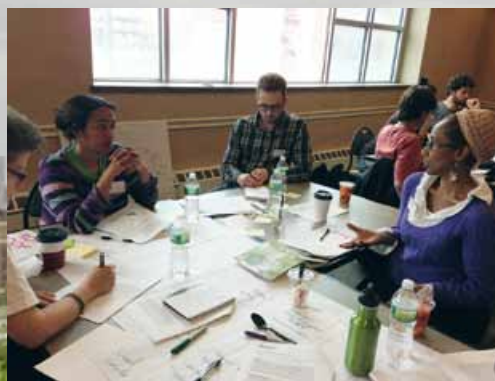
Left: Gardeners and farmers discussed the types of urban agriculture activities they want to measure.

Additional support provided by the New York City Department of Cultural Affairs, the David Rockefeller Fund, and the William and Mary Greve Foundation.