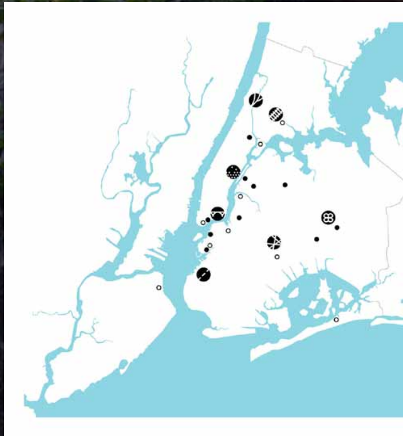
Above: The Fellows researched the different elevated infrastructure in NYC, the spaces underneath, and the communities surrounding them.