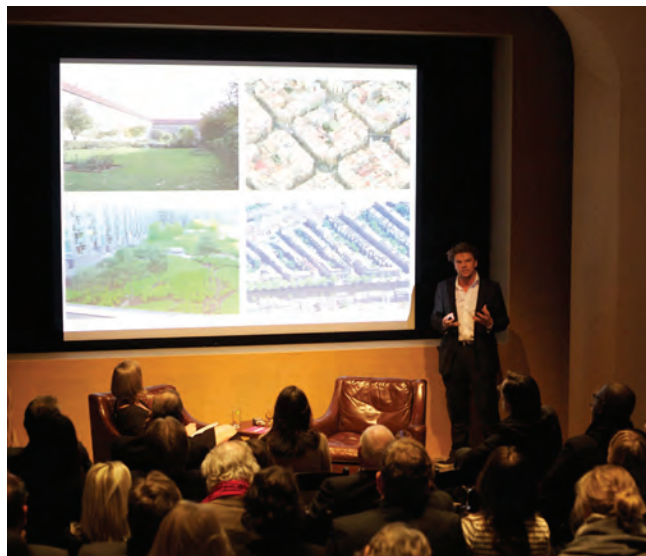
Bjarke Ingels explains his "Yes is more" philosophy at the Core Club.