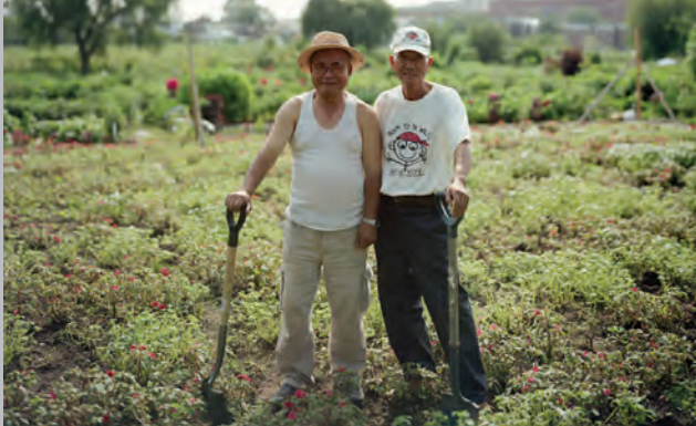
Kissena Park in Flushing, Queens