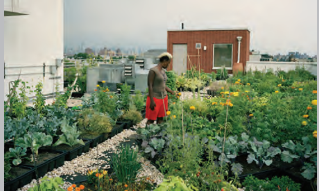
Seeds to Feed Rooftop Farm in Crown Heights, Brooklyn