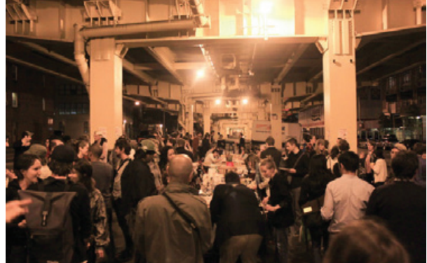
More than 100 intrepid urbanists gathered under the BQE to dine on tables made from reclaimed Brooklyn Navy Yard pallets.