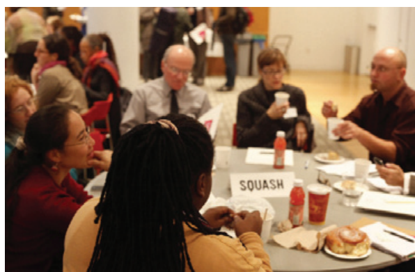
A December workshop brought together New York's diverse urban agriculture community to discuss challenges and opportunities in the field.

“ Five Borough Farm has the potential to literally reshape the city through food.”