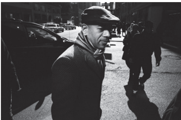
Same Time Every Day captures slivers of city life, from Rockaway Beach surf to Midtown Manhattan sidewalks.

“Shoot until you’re pretty sure you’ve shot too much, then shoot some more.”