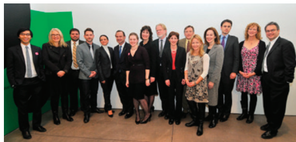
The nation's first primer on green municipal park design, High Performance Landscape Guidelines is a testament to the vision and expertise of a tireless team of fellows, peer reviewers and city officials.