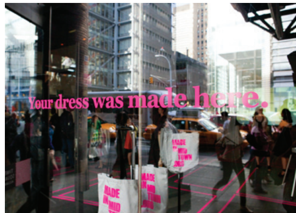
A two-day pop-up exhibit at the corner of 8th Ave and 41st Street generated a new appreciation for the creative industry occupying the adjacent Midtown blocks.

“Word of the city’s move [to shelve a highly controversial proposal to rezone the 13-block Garment Center] follows a study released this month by the Design Trust for Public Space. Instead of describing the Garment Center as a relic of a bygone industrial age, the new report bills it as a thriving and hugely productive research-and-development hub for high-end fashion.”