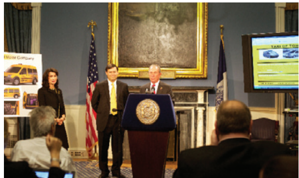
Mayor Bloomberg and TLC Commissioner Yassky announce the Taxi of Tomorrow finalists at a City Hall press conference.

USA Today , 7/29/10, "NYC Taxis Give up Their Crown" Wall Street Journal , 11/16/10, "Three Finalists Vie To Become New York's 'Taxi of Tomorrow'" The New York Times , 11/16/10, "If It Weren't Yellow, You'd Hardly Know it was a Taxi"