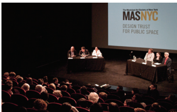
In a panel discussion, Tim Gunn touted the value of the Garment District, admitting real-world fashion production bears little resemblance to Project Runway .