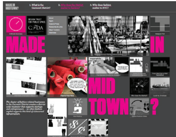
Employing multimedia tools like videos and infographics, madeinmidtown.org shed new light on an often-invisible side of the fashion industry.

The Made in Midtown website launched in June and, to date, has been viewed by more than 10,000 visitors. The Design Trust leveraged the website's impact with a month-long calendar of activities, including a press conference and two-day pop-up exhibit in the Port Authority Bus Terminal, and a series of panel discussions with the Municipal Art Society. Bringing together diverse stakeholders, the Design Trust successfully elevated both the general public's and urban policymakers' awareness — prompting the city's decision to drop its rezoning proposal and rethink plans for the future of the Garment District as a creative industrial neighborhood.