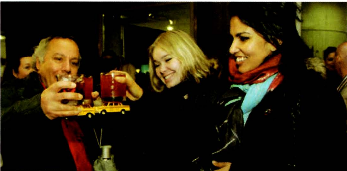
Partygoers toast 100 years of taxis in NYC with "taxi-tinis."