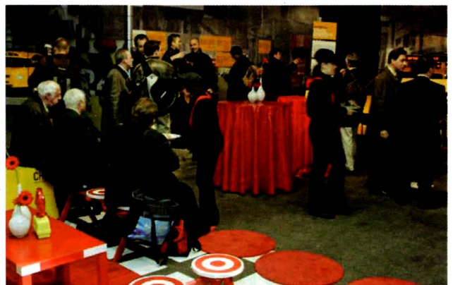
The Taxi 07 Exhibit's Opening Night Party was sponsored by Target.