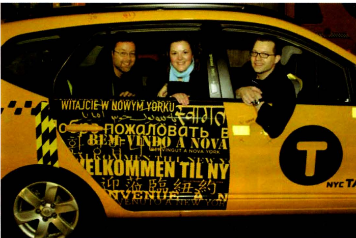
This "sketch model" of the Kia Rondo Taxi prototype displays many innovative design ideas that didn't make the final cut."