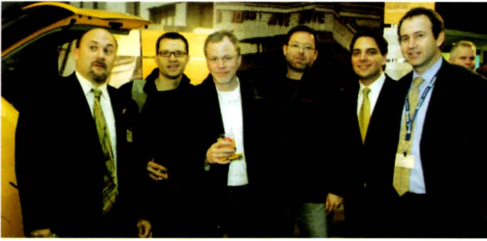
At the Taxi 07 Exhibit Opening Night Party, designers from Smart Design and officials from the Taxi & Limousine Commission discussed the future of the yellow cab.