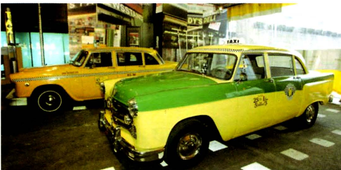
A celebration of taxis isn't complete without a look back to the Checker Cabs that made the NYC taxi the icon that it is today.

innovation and develop a taxi system strategic plan in partnership with the New York City Taxi & Limousine Commission.