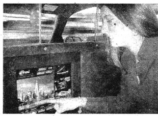
The cab of the future may have an interactive touch screen.

"New York is the capital of the world, and it's the capital of design," she said. "Why shouldn't the taxi reflect our city's commitment to sustainable mobility, access for all and great design?"