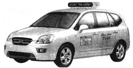
The Kia Rondo cab (above); prototype cab stand has a built-in GPS.

Exhibit celebrates 100 years with a look ahead BY GREG GATTUSO